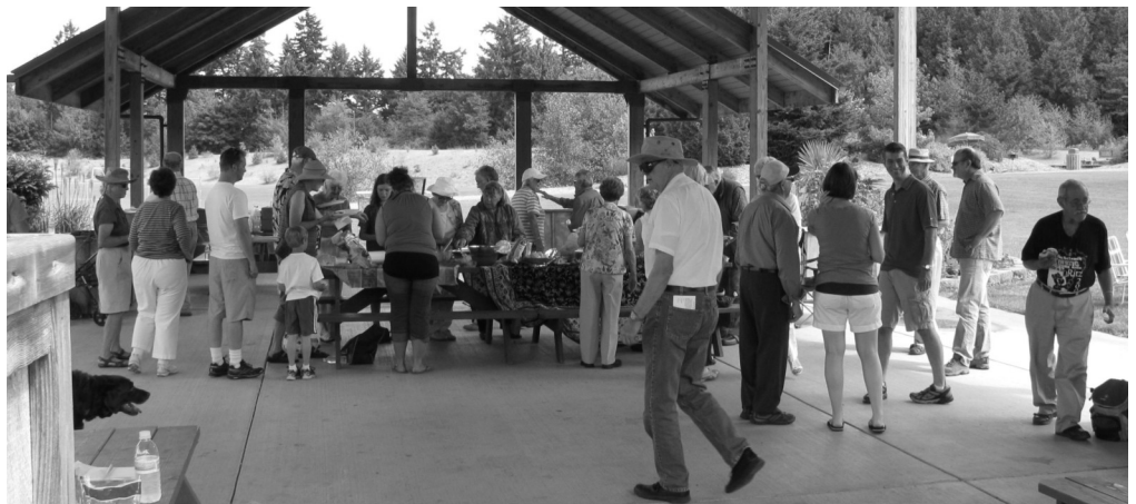
Trinity UMC held it's annual church picnic at HJ Carroll Park on Sunday, August 21. Great food and great company!