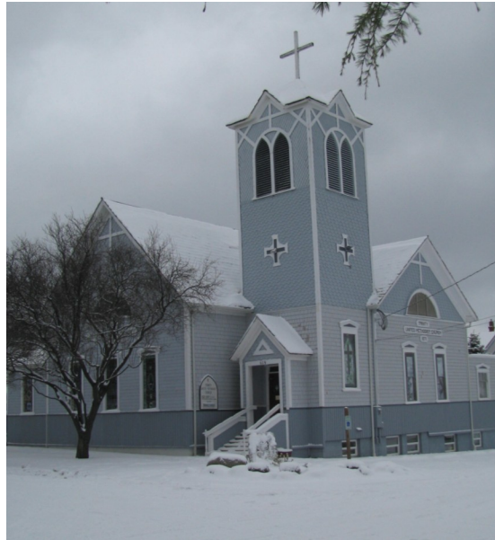
Trinity United Methodist Church on a cold, snowy day in January. Beautiful!